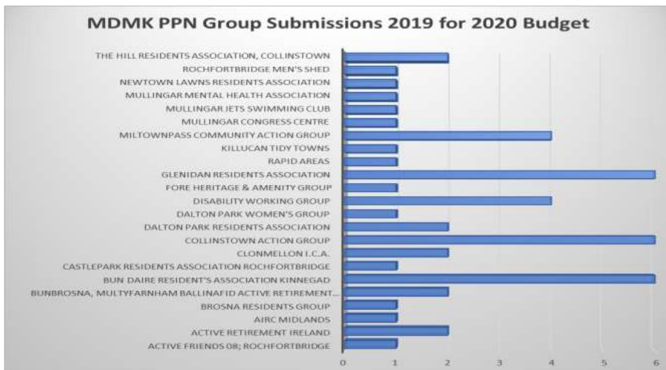
Figure 1: 23 MMD/PPN groups made 50 Submissions to Mullingar Municipal District September 2018 for 2019 Budget (Note: 4 of the submissions were not pertaining to Westmeath County Council)

In total 23 Municipal District of Mullingar Kinnegad PPN Groups made 50 submissions – (4 submissions were not council related) (Illustrated below in Figure 1 & outlined Appendix 1 & 2)