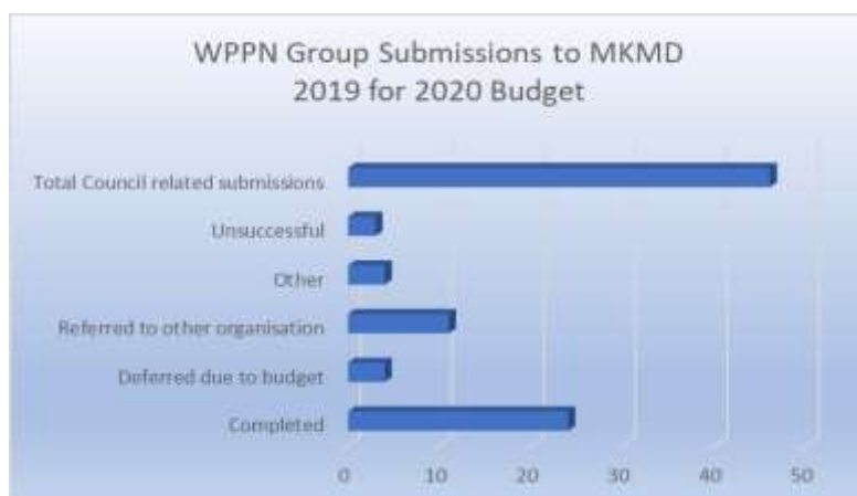
Figure 2 PPN Submissions September 2019 for 2020 Budget to Municipal District of Mullingar Kinnegad