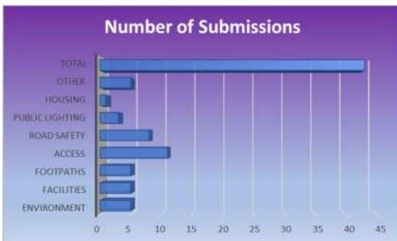
Figure 2 WPPN Submissions to Athlone/Moate Municipal District September 2019 for 2020 Budget